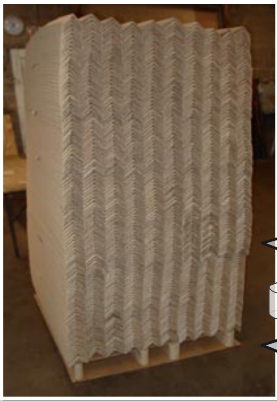
A loaded pallet prepared for shipping ▲

We have always attempted to be on the leading edge of developing new and innovative corrugated products. When our customers' requested an improved pallet, we developed the PennyPincher Pallet.™ Our first corrugated pallet was developed in 1997. Since then, it has gone through five major revisions to the superior final product. These corrugated pallets are designed and developed by our internal specialists here at the St. Marys Box Company, who have 115 years of combined experience.